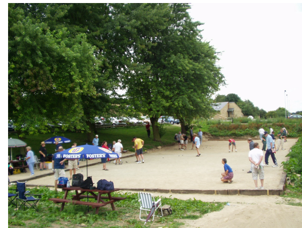
The terrain at Wetherby Sports Association (see back for club details)