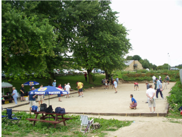
The terrain at Wetherby Sports Association (see back for club details)